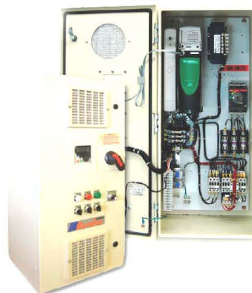
UnidriveSP RapidPak Family

Being Digital, the Unidrive SP series has a Windows Software program to permit easy setup, recording the setup file and diagnosis. This software is available free for examination and use at: